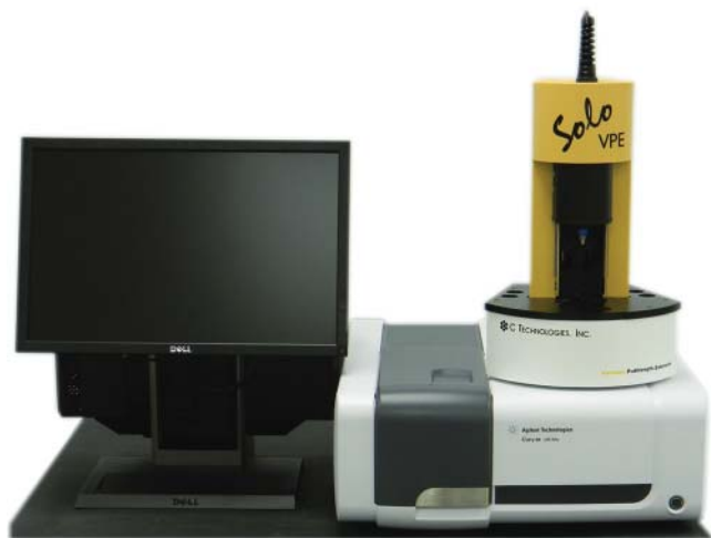
SoloVPE system by C Technologies, Inc. ( http://solovpe.com )

Because there is no sample manipulation and the SoloVPE System is at its core a UV technique, validation of the instrument and methods is straightforward. The same SoloVPE method can be used across analytical and process development, quality control, and manufacturing. Once the system is implemented on the manufacturing floor, the need to send STAT UV samples to QC for in-process testing is eliminated.